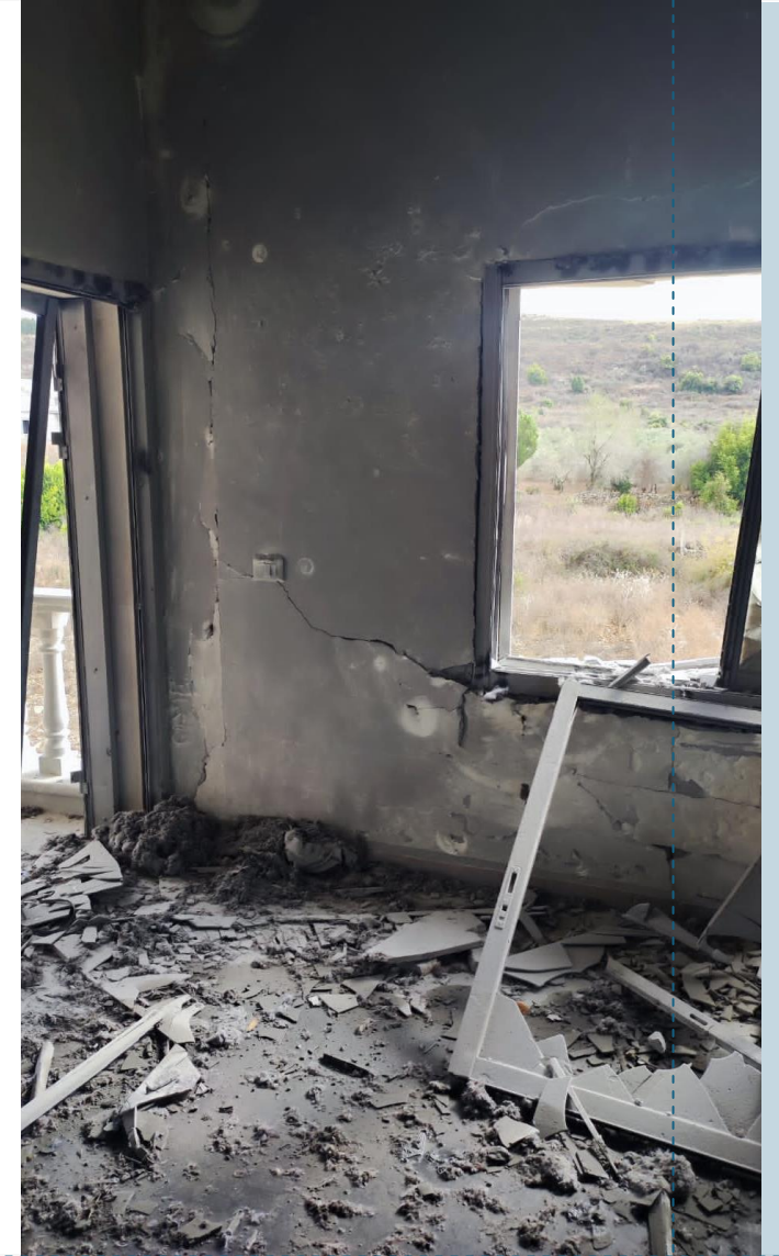
Destruction in Aalma El Chaeb