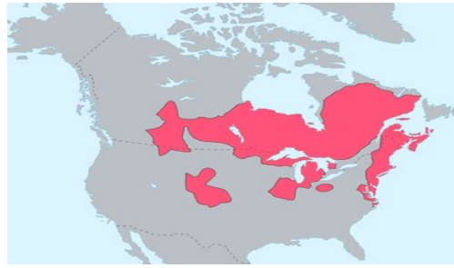
Pre-contact distribution of Algonquian languages

The Doctrine of Discovery in the United States is a principle of law by which “fee title to the lands occupied by Indians when the colonists arrived became vested in the sovereign--first the discovering European nation and later the original States and the United States.” The U.S. Supreme Court interpreted “discovery” to mean that when European, Christian nations “discovered” lands unknown to Europeans, they automatically gained sovereign and property rights in the lands. This was so, even though Indigenous people had occupied and used the lands for millennia.